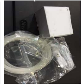
Tube and Adapters